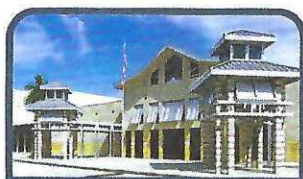
Palm Beach Central High School 8499 Forest Hill Boulevard, Wellington, FL 33411

Prepare a "go kit" with personal items you cannot do without during an emergency. If you evacuate, allow at least twice the usual travel time. Shut off water and gas to home. Take photo ID and proof of address. Unplug or turn breaker off to hot water heater.