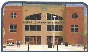
John I. Leonard High School 4701 10th Avenue North, Greenacres, FL 33463